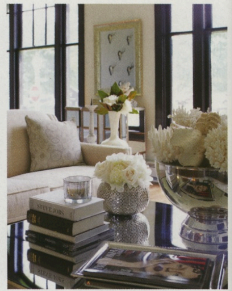
ABOVE: THE CREAMY COLOR PALETTE AND LIGHT-REFLECTING SURFACES MAKE THE YORK HOUSE DRAWING ROOM AN ESPECIALLY CHEERFUL SPOT DURING THE DAYLIGHT HOURS.