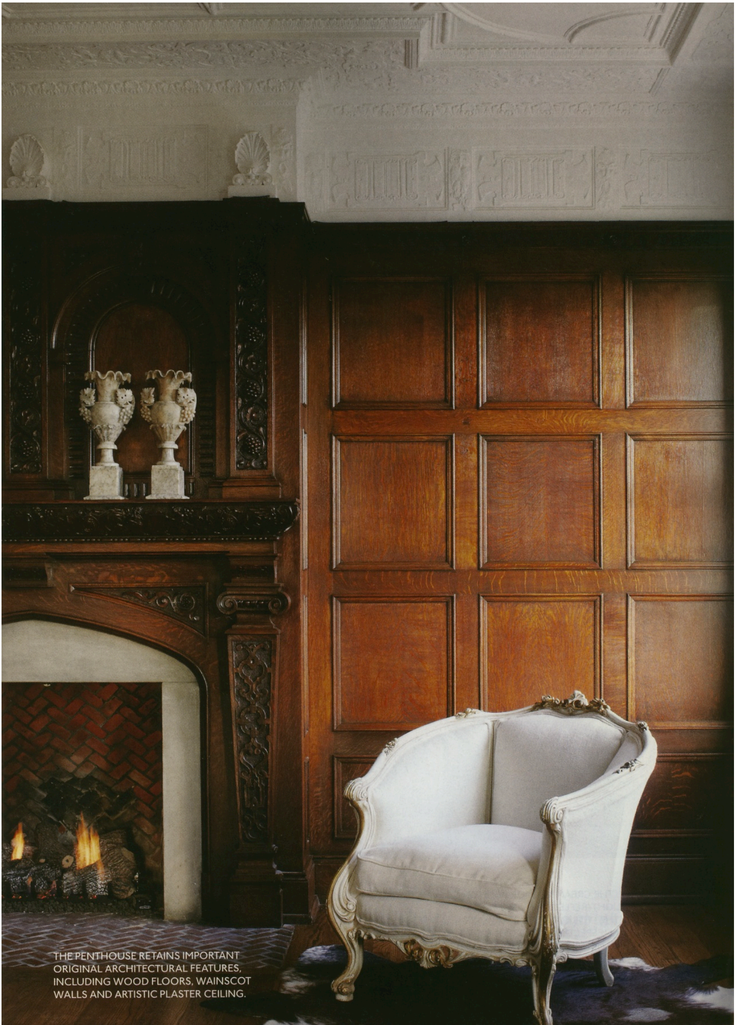
THE PENTHOUSE RETAINS IMPORTANT ORIGINAL ARCHITECTURAL FEATURES, INCLUDING WOOD FLOORS, WAINSCOT WALLS AND ARTISTIC PLASTER CEILING.