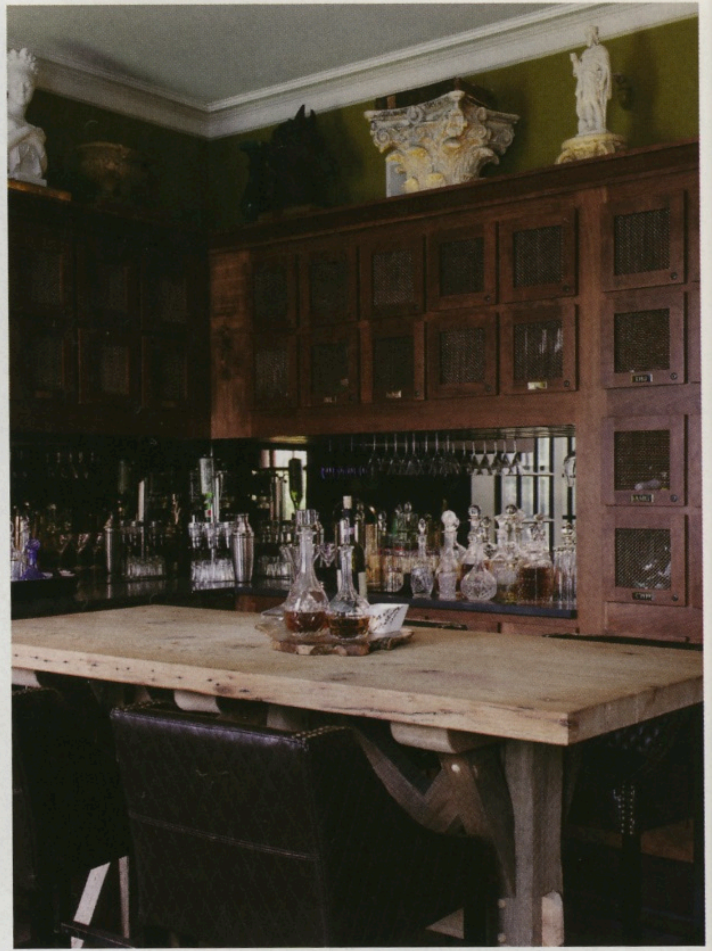
A RUSTIC, CUSTOM-MADE TABLE WITH A RECLAIMED-WOOD TOP IS THE PERFECT PLACE TO GATHER AROUND FOR A DRINK WHEN FRIENDS COME TO CALL. EACH RESIDENT HAS HIS OR HER OWN MINIATURE LIQUOR CABINET COMPLETE WITH BRASS NAMEPLATE.

they only are part of what makes this $12-million development so remarkable. It is the common areas, notably the lobby, drawing room and library bar, which set York House apart and impart the chic European ambience that is so palpable.