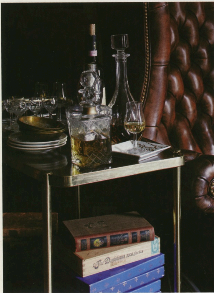
BOOKS, GAMES AND LIBATIONS ARE STAPLES IN THE LIBRARY BAR.