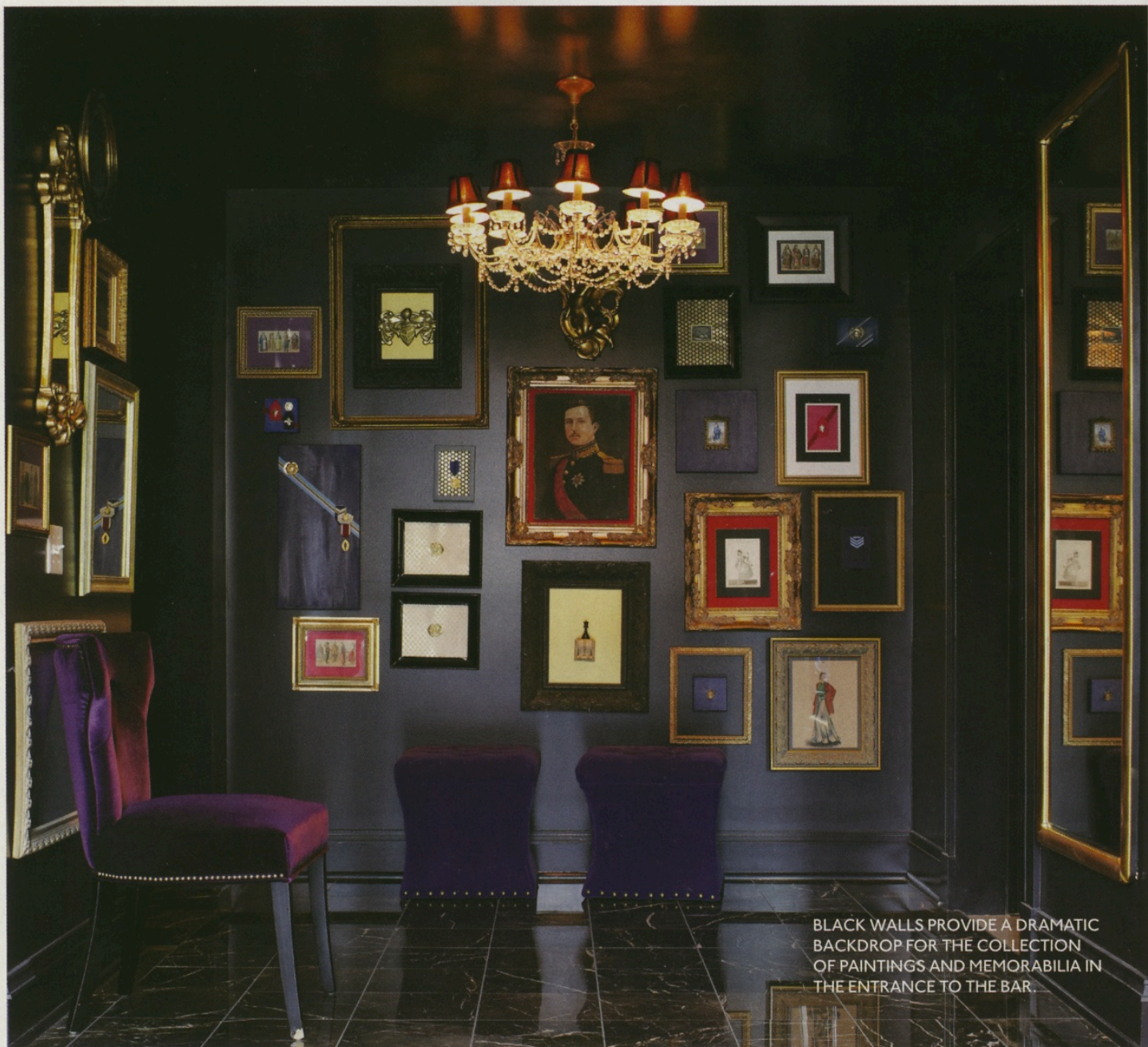
BLACK WALLS PROVIDE A DRAMATIC BACKDROP FOR THE COLLECTION OF PAINTINGS AND MEMORABILIA IN THE ENTRANCE TO THE BAR.