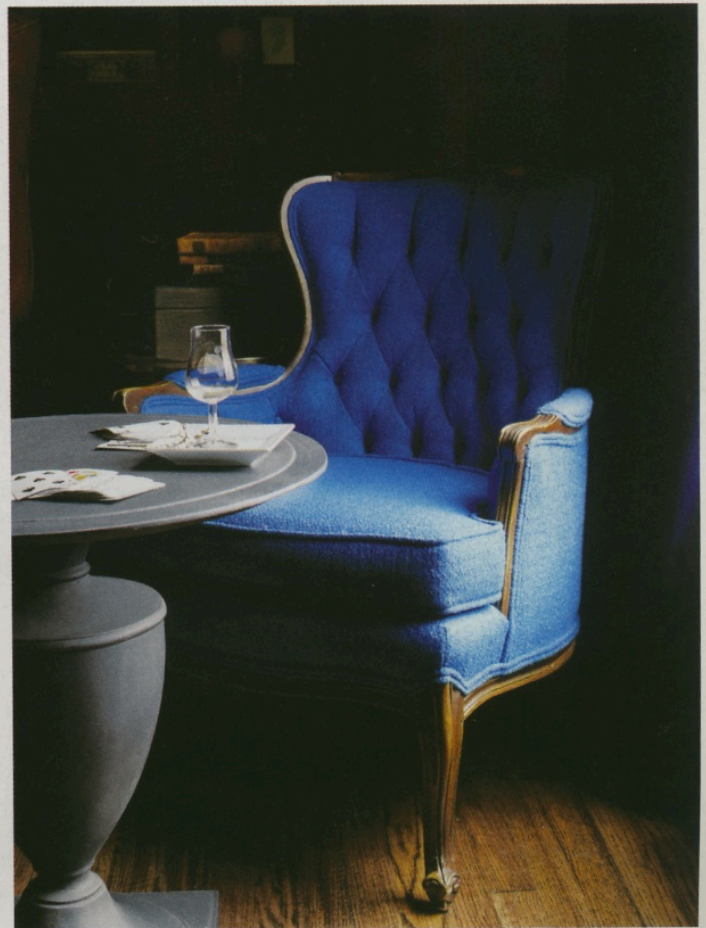
TOP RIGHT: QUIRKY DETAILS ENHANCE THE VINTAGE-CHIC ATMOSPHERE. BOTTOM RIGHT: A GREAT PLACE FOR A DRINK AND A GAME OF CARDS.